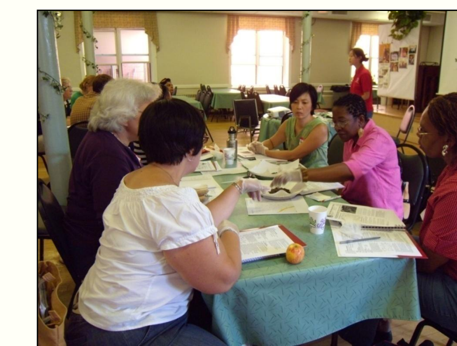
Figure 6: Urban gardeners and teachers learn about soil and strategies for mitigating exposure to contaminants.