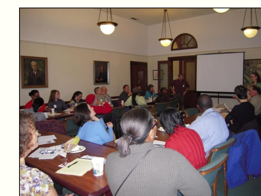
Figure 4: Garden managers and educators learn about soil sampling and testing protocols.