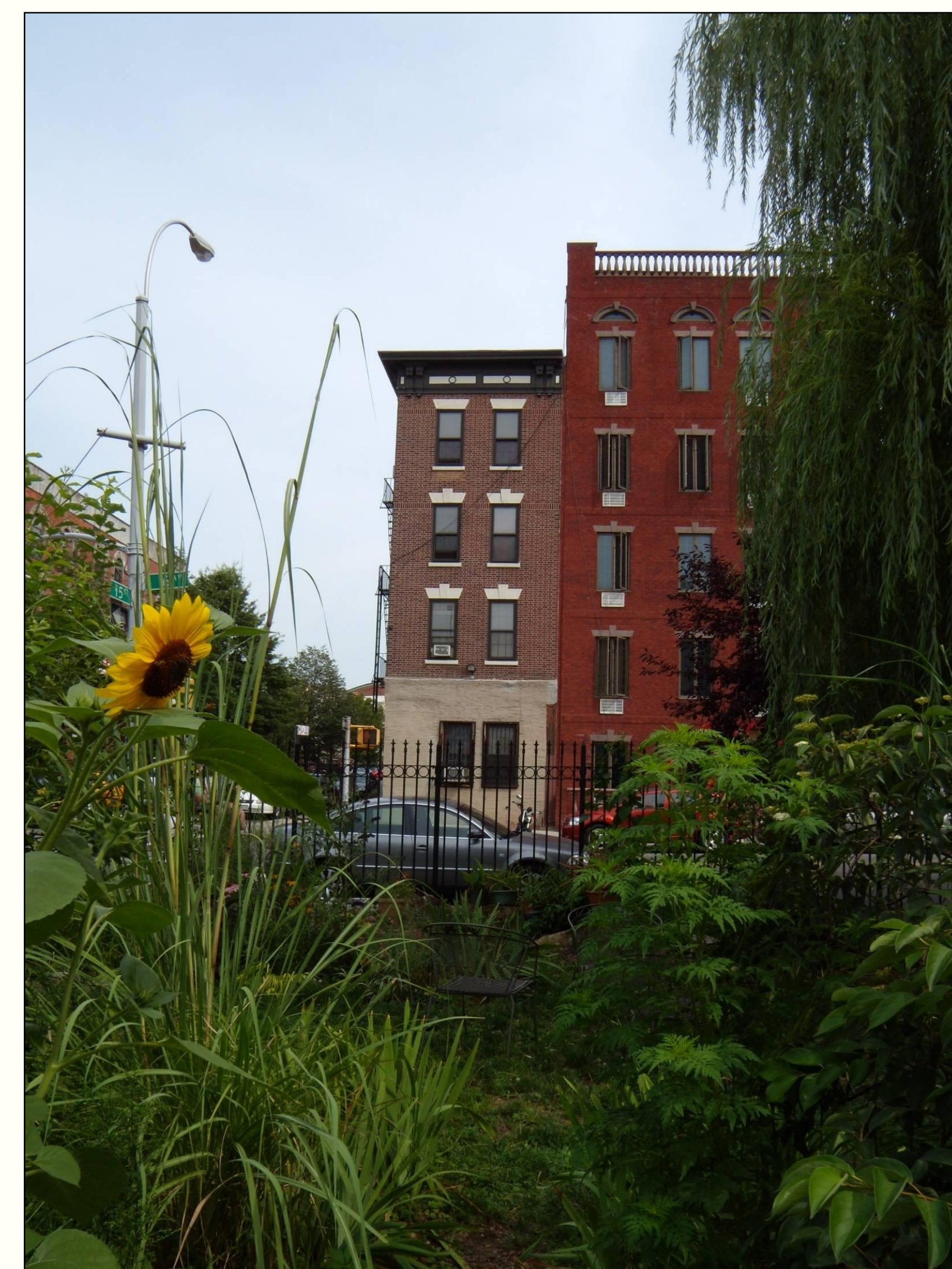
Figure 3: A community garden in Brooklyn that had been a vacant lot with illegal dumping. Top soil was brought in to cover the contaminated site.