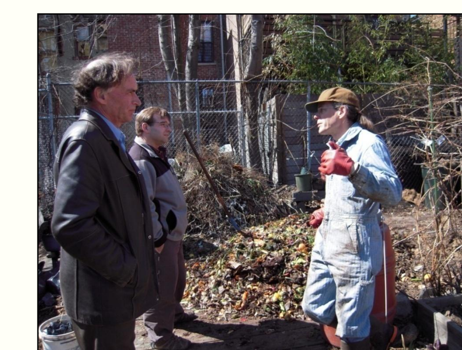
Figure 5: Cornell researchers visit the compost operation at a Brooklyn community garden.